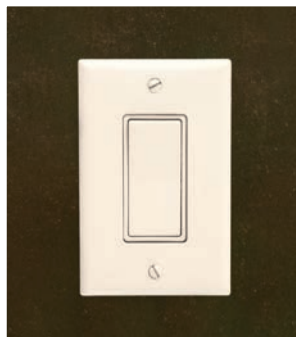
FWS Wall Switch

Take charge of your fireplace with a battery-operated remote control, thermostat remote, electric remote control, wall thermostats, or wall switch – available for Millivolt and IP.