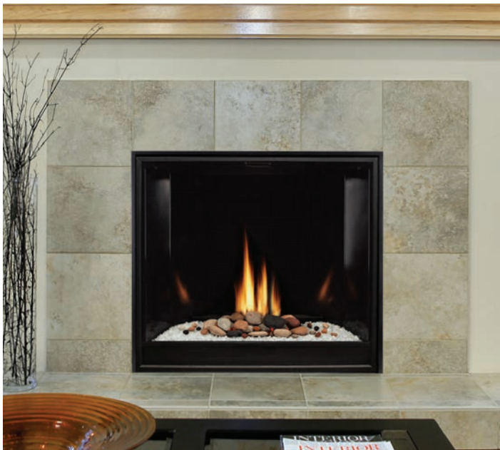
Tahoe Premium Clean-Face Direct-Vent Fireplace (DVCC36BP) with Black Porcelain Liner and Decorative Rock Set, Installed in a Custom Mantel with Custom Surround