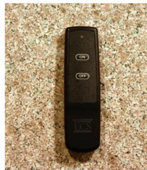
FRBC or FREC Remote Control