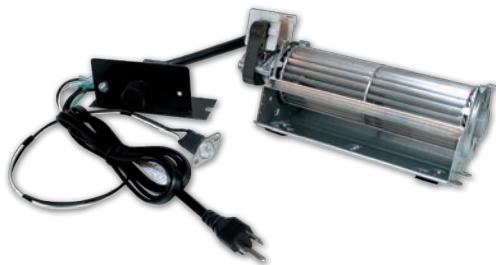
Optional Variable-Speed Blower

The available lighting kit draws attention to the intricate details in the log set and liner – even when no fire is burning. Enhance heat distribution with the optional variable-speed blower. Both the light and blower include dimmer controls.