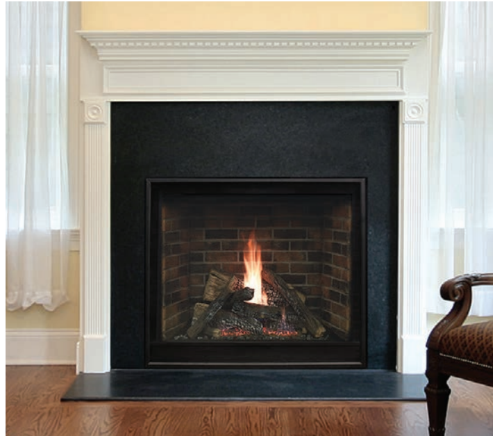
Tahoe Premium Clean-Face Direct-Vent Traditional Fireplace (DVCP36BP) with Aged Brick Liner Installed in a Custom Mantel with Custom Surround

The Premium Clean-Face Traditional Tahoe includes a tempered glass view window and a unique burner that delivers a rich flame pattern. The ceramic fiber log set is required (but sold separately). Each log is hand painted for stunning realism with detailed bark, knots, and charring.