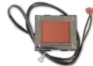
Optional Lighting Kit